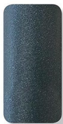
P06 GRIS GRAINÉ