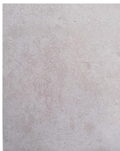
C2 BEIGE BETON