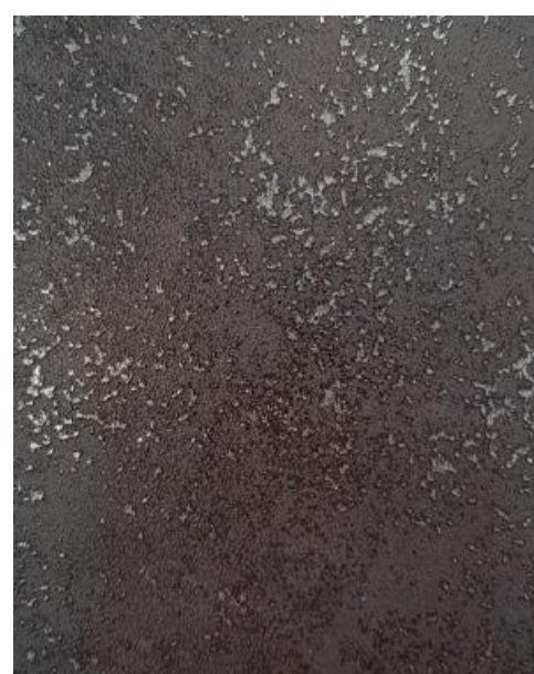
C31 IRON COOPER